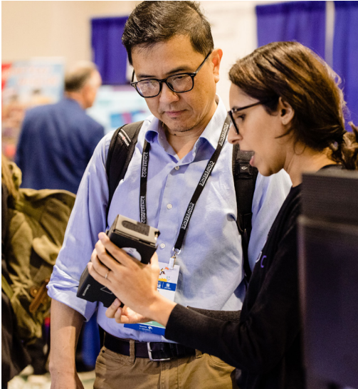
EXHIBIT BOOTH FEES