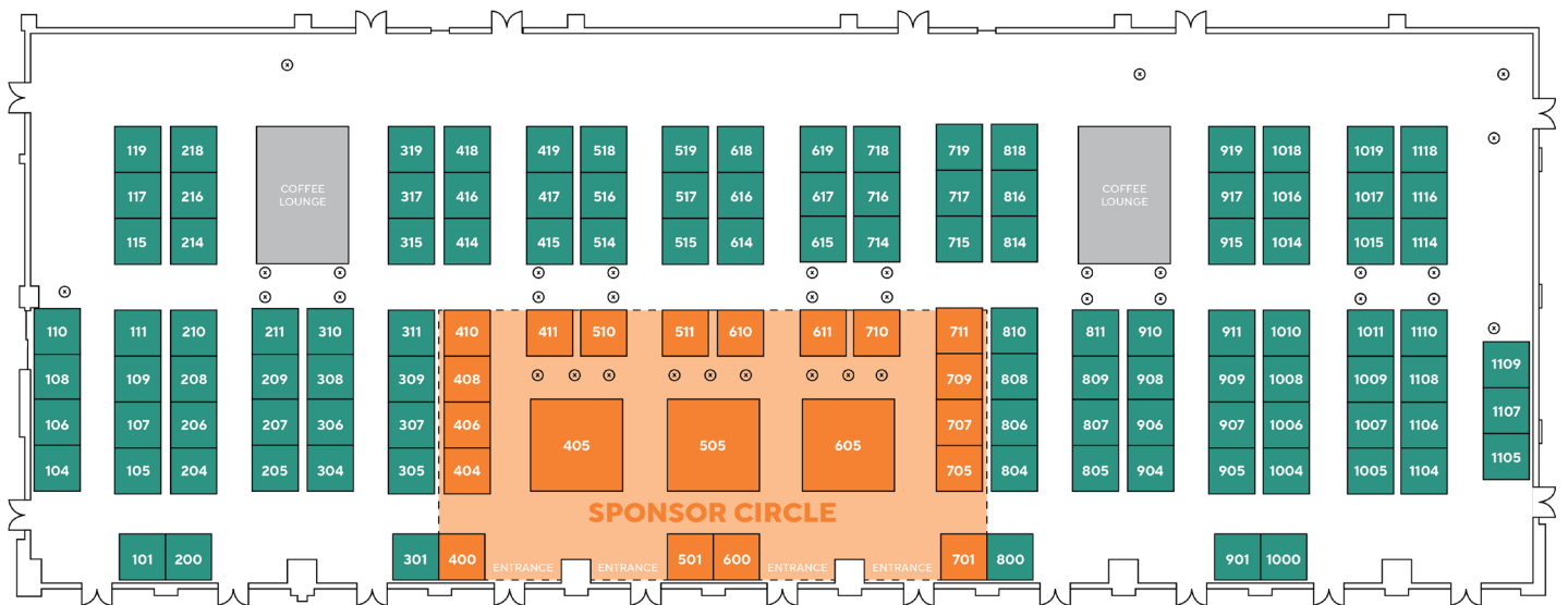
EXHIBIT HALL FLOOR PLAN